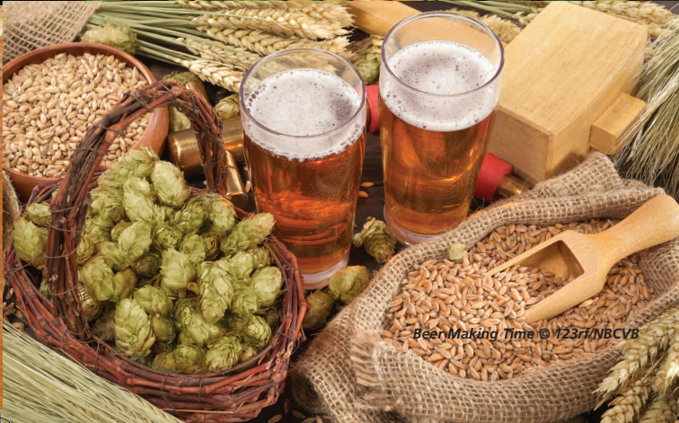
Beer Making Time