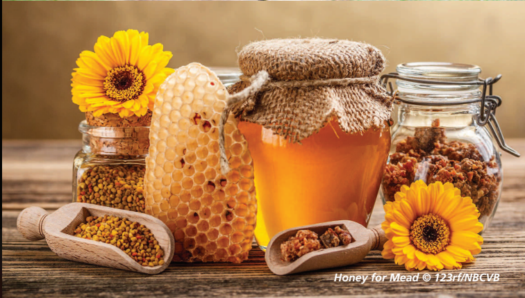
Honey for Mead