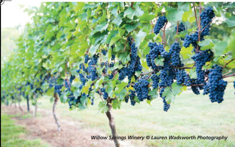
Willow Springs Winery