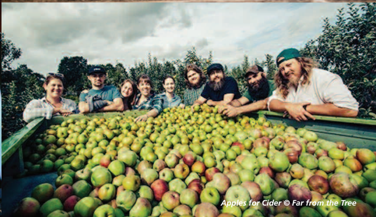
Apples for Cider